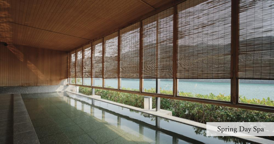
Spring Day Spa