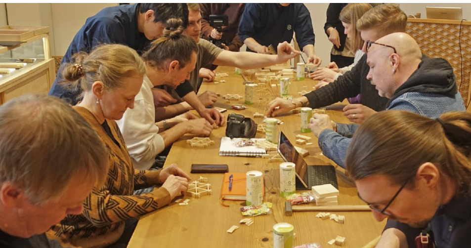
Kumiko Woodwork Workshop