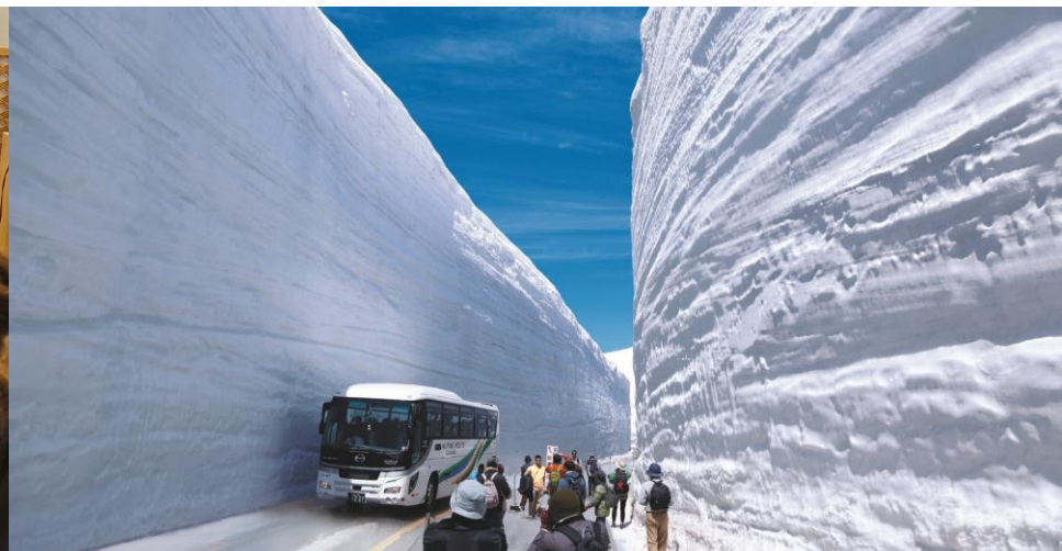
Tateyama Kurobe Alpine Route