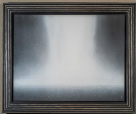
《 Water fall 》 Hiroshi Senju