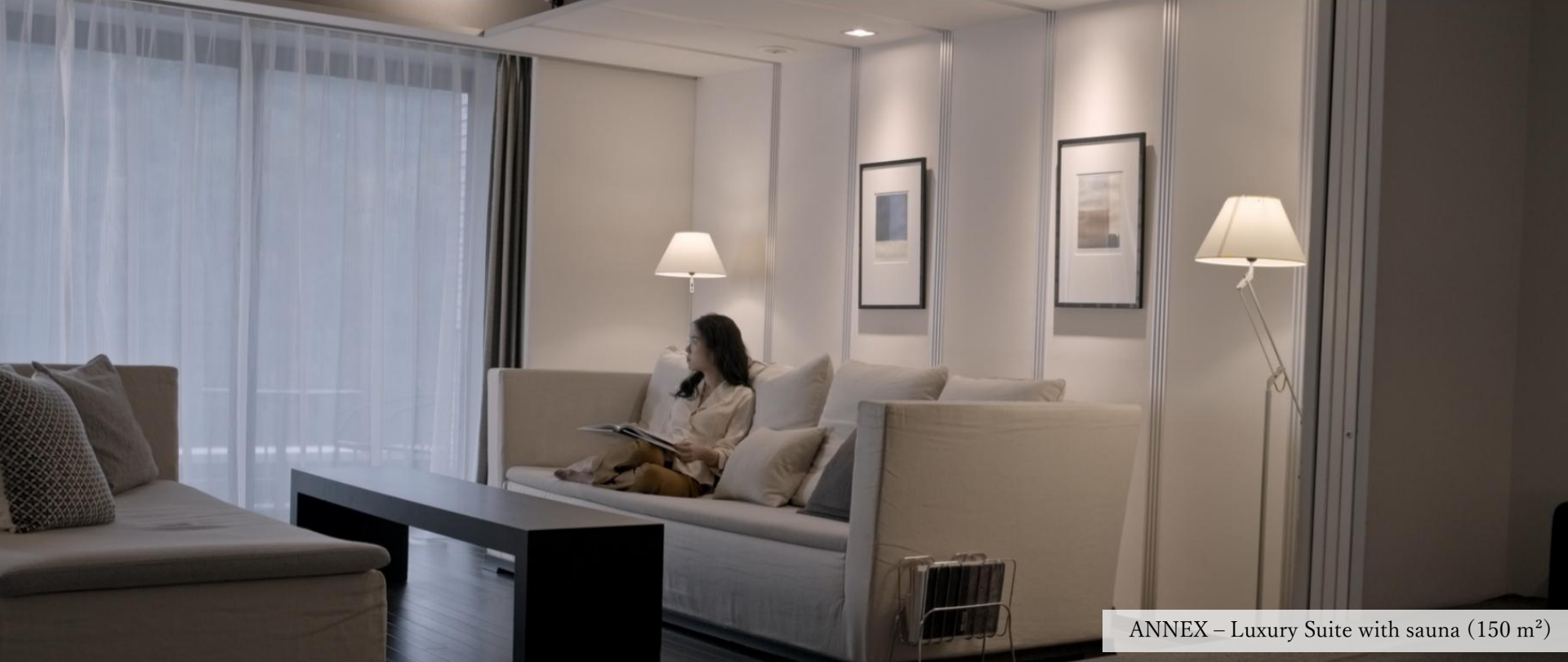
ANNEX – Luxury Suite with sauna (150 m 2 )